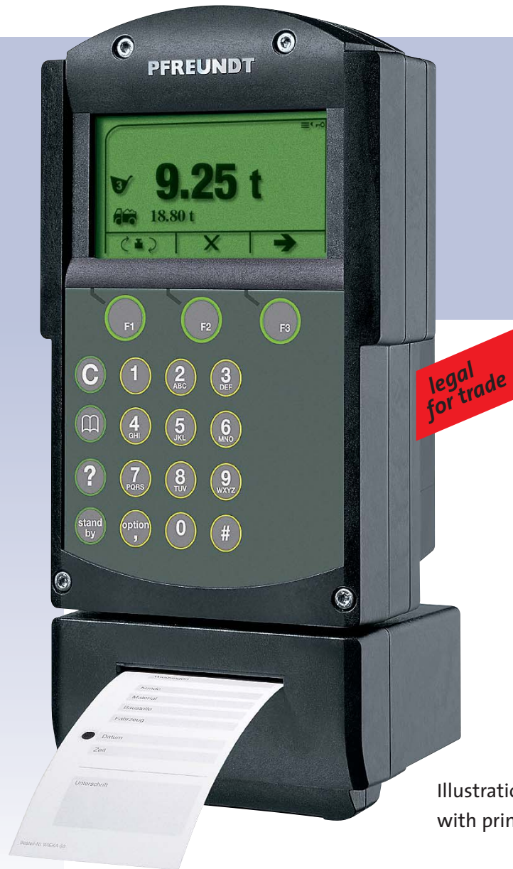
Illustration WK 50 with printer

Ask us about our efficient P.O.S. branch software