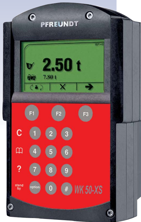
Illustration WK 50-XS

(* In order to equip the WK50-S or WK50 for approved applications, a pressure sensor with temperature control may be necessary/may need to be upgraded.