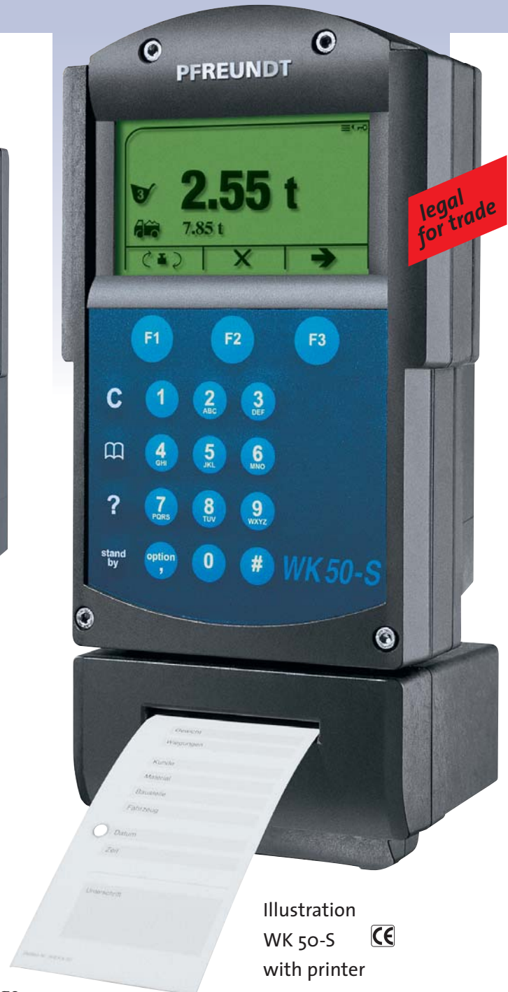
Illustration WK 50-S with printer

Upgradable to the WK 50 by simply changing the electronics.